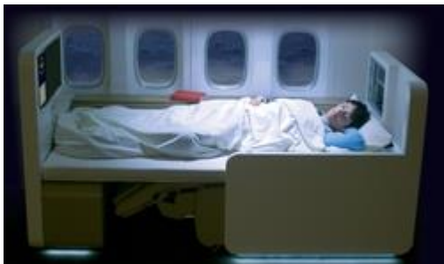
EADS Sogerma and Lufthansa Technik's Ultimate Sleeper (aka aerosleeper)

EADS Sogerma is one company that specializes in seat design. Their new Ultimate